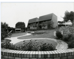
Warilda, Brisbane (84 Kedron Park Rd, Woolloowin)

Description: This is a photograph of the Warilda Receiving and Assessment Centre in 1979. It shows a garden with brick walls and children's play equipment in front of a two-storey brick building with a sloping face. Walkways connecting to other parts of the centre can be seen at the back of the brick building.