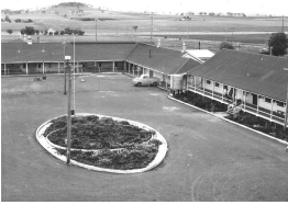
Dormitory Buildings - Farm Home for Boys, Westbrook

Description: This is a photograph of the dormitories at the Farm Home for Boys, Westbrook, taken in 1963. The photo, taken from above, shows a range of single-storey buildings at right-angles to each other, surrounding a central courtyard with an oval garden bed in the middle. Several boys are visible on the balcony of one of the buildings.