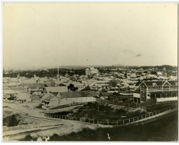
Infants Home right foreground, corner Turbot and Edward Streets, Parliament House in background (centre) - Brisbane