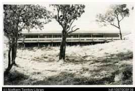
Kormilda College residential building

Description: This is a copy of a photograph from 1995. Its Northern Territory Library catalogue description is 'Kormilda College, old girls' dormitory'.