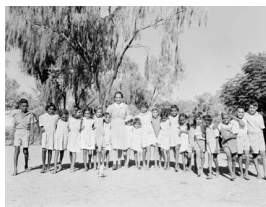
St Mary's Hostel - Matron in charge and children [altered from original title]