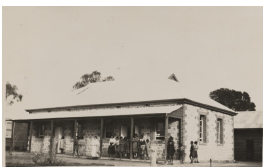
Stone Cottages, Carrolup Native Settlement, Western Australia

Description: This is an image of Carrolup in Western Australia. It shows a group of women and children standing in front of a large stone and brick cottage. Smaller timber buildings are visible in the background.