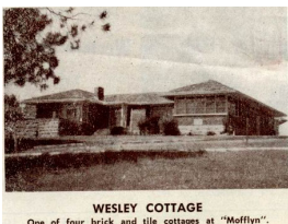
Mofflyn, Wesley Cottage

Description: This is a picture of Wesley Cottage, which was part of Mofflyn. It comes from the December 1965 edition of the Methodist Homes for Children's newsletter, called The 'Homes' Herald .