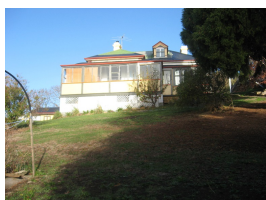
The former Hillcrest Children's Home - front view