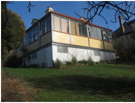
Hillcrest Children's Home- showing the verandah where some children slept