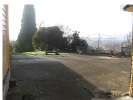
Hillcrest Children's Home - the concrete area to the side where children played with wheeled toys