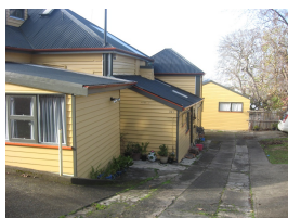
The back of the former Hillcrest Children's Home