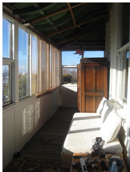
The verandah where some children slept at the former Hillcrest Children's Home