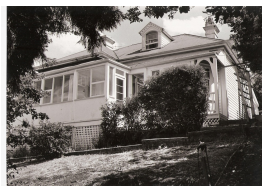
Hillcrest Children's Home when it opened