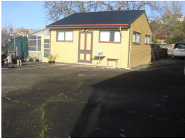
An outbuilding at the former Hillcrest Children's Home