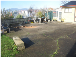
Hillcrest Children's Home - the concrete area where children played with wheeled toys