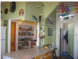
The kitchen at the former Hillcrest Children's Home

Description: In 2013, the structure of the kitchen is the same as when the building was a children's home.