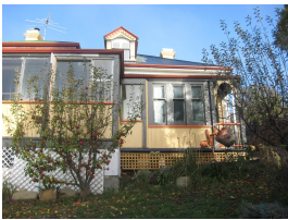
The former Hillcrest Children's Home at the front from the right hand side

Description: The clothes line jutted out over a slope on its own narrow piece of concrete, an extension to the concrete playing area.