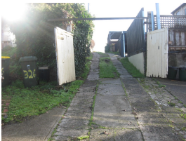
The back gates at the former Hillcrest Children's Home