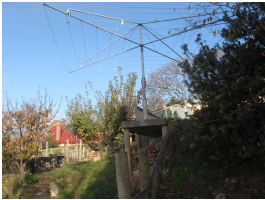
The former Hillcrest Children's Home - the clothes line

Description: The clothes line jutted out over a slope on its own narrow piece of concrete, an extension to the concrete playing area.