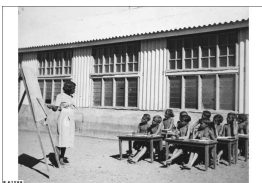
School at Ernabella Mission

Description: The library catalogue includes the description: A class of Aboriginal students and their teacher outside the school at Ernabella Mission.