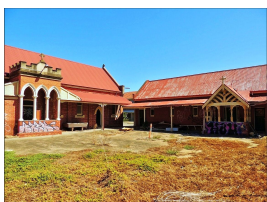
The Boys Town Chapel and Hall

Description: This is an image from the former site of St John's Boys Town and St John the Baptist Home for Boys.