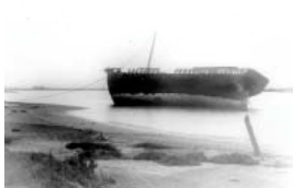
Boys Reformatory Hulk, Fitzjames

Description: This photo is undated, the date included is an estimate. This webpage is no longer in operation. This URL is taken from the wayback machine and is dated 12 March 2022.