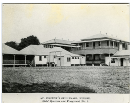
St Vincents Orphanage Girls Dormitory, Queens Road Nudgee

Description: This is a photograph of the Girls' Dormitory at the St Vincent's Orphanage, taken 1910. It shows a range of several single and double storey buildings bordering a grass field. A caption printed at the bottom of the image reads "St. Vincent's Orphanage, Nudgee. Girls' Quarters and Playground No. 1"