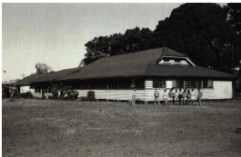
Back of big boys dormitory, St Vincent's Orphanage

Description: This photo is undated, the date included is an estimate.