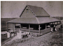
Chook House, St Vincent's Orphanage

Description: This photo is undated, the date included is an estimate.