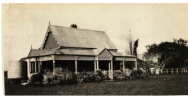
Visitors cottage, St Vincent's Orphanage

Description: This photo is undated, the date included is an estimate.