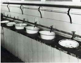
Wash room at St Vincent's Orphanage