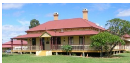
Canaan Training Room, Riverview