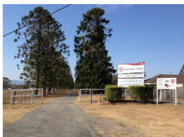
Entrance to Riverview Farm

Description: The Salvation Army has occupied this site since 1897. The avenue of pines was planted c.1920s.