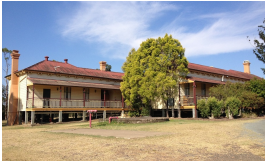
Original buildings, Riverview