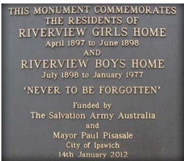
Plaque on memorial plinth at Riverview

Description: This is an image of a memorial plaque at Riverview. The inscription reads: "This monument commemorates the residents of Riverview Girls Home April 1897 to June 1898 and Riverview Boys Home July 1898 to January 1977 'Never to be forgotten' Funded by The Salvation Army Australia and Mayor Paul Pisasale City of Ipswich 14th January 2012"