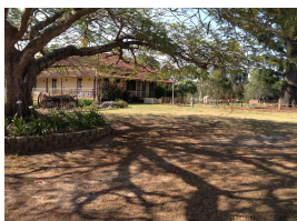
Front entrance to original home, Riverview

Description: The Salvation Army has occupied this site since 1897. The avenue of pines was planted c.1920s.