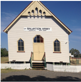
Salvation Army Hall, Riverview