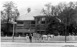
Lady Bowen Lying-In Hospital on Wickham Terrace, Brisbane