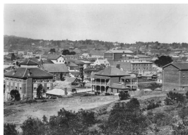
Lady Bowen Hospital in Brisbane, ca. 1875