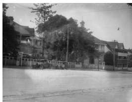
Lady Bowen Hospital in Brisbane, 1934