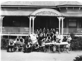
Children pictured outside the Montrose Home for Crippled Children

Description: The library catalogue includes this description: Young girl sitting on a rug at the Montrose Crippled Children's Home, playing dress-ups with her dolls. Many different styles of dolls' hats are scattered across the floor.