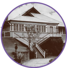
Montrose Home for Crippled Children, Taringa

Description: This is an image of the Montrose Home for Crippled Children at Taringa. It shows a large single-storey house with enclosed front verandahs and a large double staircase leading to the front from the driveway. This image is undated, the date included is an estimate