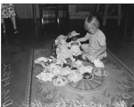
Young girl playing with her dolls, 1952 [altered from original title]

Description: This is an image of the Montrose Home for Crippled Children at Taringa. It shows a large single-storey house with enclosed front verandahs and a large double staircase leading to the front from the driveway. This image is undated, the date included is an estimate