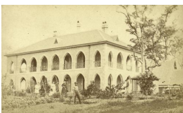
Bishopsbourne in Milton

Description: This photo is undated, the date included is an estimate only.