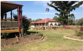
Looking towards visitor residence