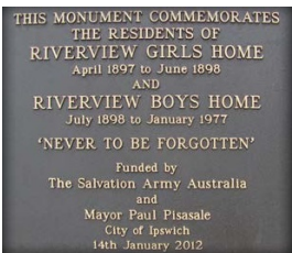
Plaque on memorial plinth at Riverview

Description: This is an image of a memorial plaque at Riverview. The inscription reads: "This monument commemorates the residents of Riverview Girls Home April 1897 to June 1898 and Riverview Boys Home July 1898 to January 1977 'Never to be forgotten' Funded by The Salvation Army Australia and Mayor Paul Pisasale City of Ipswich 14th January 2012"