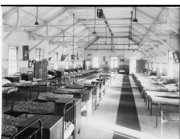
Dormitory: Gosford Boys Home

Description: This is a photograph of the boys dormitory at Gosford Training School. It shows three rows of steel-framed beds and bed-side dressers in a long, high-ceilinged hall.