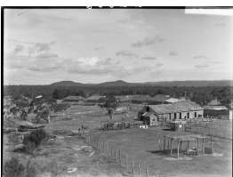
Child Welfare Farm Home for Boys, Gosford - the home

Description: This is a photograph of the boys dormitory at Gosford Training School. It shows three rows of steel-framed beds and bed-side dressers in a long, high-ceilinged hall.