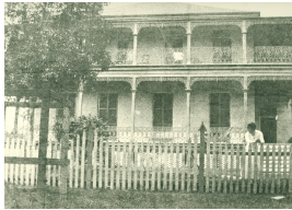
The original Milleewa

Description: This is a copy of an image owned by Anglicare Out of Home Services.