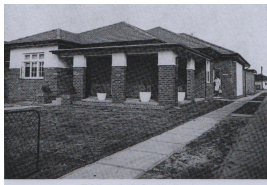
"Worimi" - opened on 30th June, 1966 at Newcastle

Description: This series of pictures is captioned as being of the Worimi Centre at Wollongong, but there has never been such an organisation. This is thought to refer to the Worimi Centre at Newcastle.