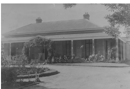
Yasmar - Children's Court and Administration Building

Description: This is a digital copy of a photograph from an album collected by Child Welfare Department officers in the late 1940s. From the collection of Leonie Knapman.