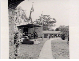
Opening of 'Tallimba' by J. Waddy, Minister