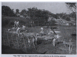
"May Villa" boys show improved ability and co-ordination on the climbing equipment

Description: This is a copy of an image that appeared in the Child Welfare Department of New South Wales Annual Report of 1964.