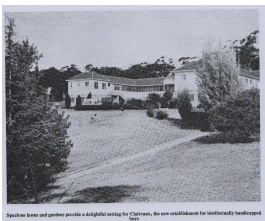
Spacious lawns and gardens provide a delightful setting for Clairvaux, the new establishment for intellectually handicapped boys [original caption]

Description: This photo is undated, the date included is an estimate.