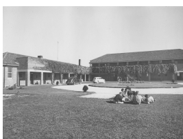
Berry Training Farm - the house

Description: This is a digital copy of a photograph from an album collected by Child Welfare Department officers in the late 1940s. From the collection of Leonie Knapman.