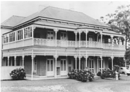
The Nest (Arncliffe Girls Home)

Description: This photo is undated, the date included is an estimate.