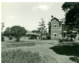
Havilah - Carlingford - 754 Pennant Hills Road Carlingford (29 Bevan Place Carlingford)

Description: This is an image that appeared in a real estate listing in Homebound in 2012.