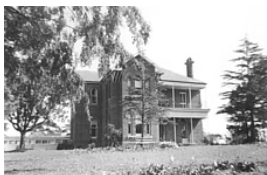
Havilah Little Children's Home

Description: This photo is undated, the date included is an estimate.