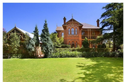
29 Bevan Place Carlingford: "Havilah House" - Regal Estate 1588sqm

Description: This photo is undated, the date included is an estimate.