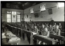
Boys in the classroom