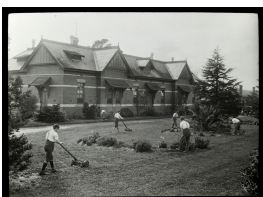
Boys mowing the lawn

Description: This is a photograph showing one of the dormitories at the Clifden Farm and Try Boys Home at Wedderburn. It is part of the Try Boys Society Collection of photographs held by the State Library of Victoria.