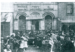
Waiting for the Christmas Feast at the Ragged Boys Home and Mission, Latrobe Street, Melbourne

Description: This is a copy of a photograph published in 'One Thousand White Onions': a history of caring for children since 1865 on p.21.