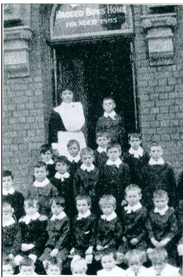
Matron and her charges at the Melbourne Ragged Boys Home

Description: This is a copy of a photograph published in 'One Thousand White Onions': a history of caring for children since 1865 on p.7.