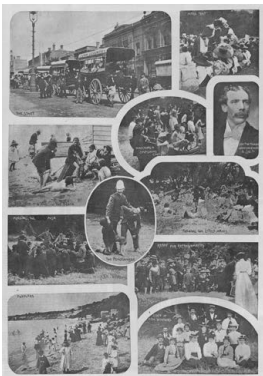
The Ragged School Children's Picnic

Description: This is a copy of a photograph published in 'One Thousand White Onions': a history of caring for children since 1865 on p.20.