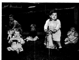
Children in the nursery - "Turana"

Description: This is a copy of an image published in the annual report for the Victorian Children's Welfare Department for 1956.