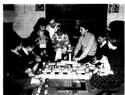
A cottage group - "Turana"

Description: This is a copy of an image published in the annual report for the Victorian Children's Welfare Department for 1956.