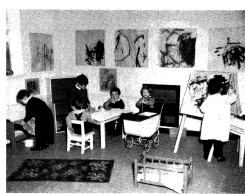
Section of the new kindergarten - 'Turana'

Description: This is a copy of an image published in the annual report for the Victorian Children's Welfare Department for 1956.