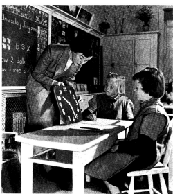
Pleasant Creek Special School

Description: This image appeared in the Department of Mental Hygiene's annual report for 1953.