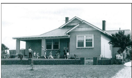
Children at play at Williams Street

Description: This is a copy of a photograph published in 'One Thousand White Onions': a history of caring for children since 1865 on p.190.