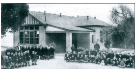
School No.4136 in the grounds of the Home staffed by members of the Education Department

Description: This is a copy of a photograph published in 'One Thousand White Onions': a history of caring for children since 1865 on p.147.