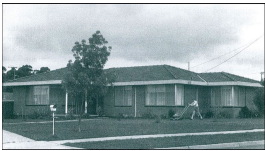
A family group home at Karingal, later sold

Description: This is a copy of a photograph published in 'One Thousand White Onions': a history of caring for children since 1865 on p.149.