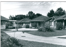
Attractive flats for homeless young people [editor's note: this is the original caption]

Description: This is a copy of a photograph published in 'One Thousand White Onions': a history of caring for children since 1865 on p.174.