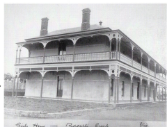
Girls Home - Riddell's Creek - Vic.