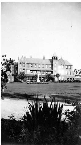
Looking Across a Lake and Lawns to the Orphanage at Bendigo

Description: From the Collection: The biggest family album in Australia.