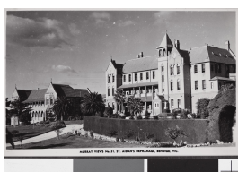
St Aidan's Orphanage, Bendigo