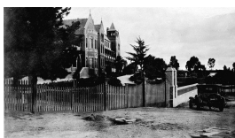
Negative - Bendigo, Victoria, circa 1920

Description: From the Collection: The biggest family album in Australia.