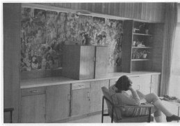
Enjoying privacy and quiet in Allambie's unit for adolescent girls.

Description: This is a copy of an image published in the annual report for the Social Welfare Department for 1975-6, p,21.