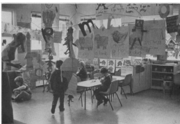
Grade 3 of Allambie school.

Description: This is a copy of an image published in the annual report of the Social Welfare Department for 1974-5.