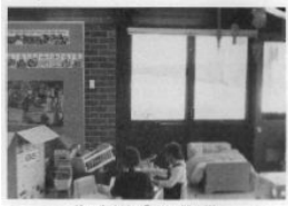
New Activities Centre, Allambie.

Description: This image appeared in the Department's annual report for 1960.