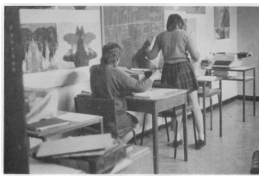
Typing is one of the school subjects for the older girls at Allambie.

Description: This is a copy of an image published in the annual report for the Social Welfare Department for 1974-5.