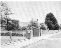
Allambie - 7 Reception Centre for children.

Description: This is a copy of an image published in the annual report of the Social Welfare Department for 1974-5.