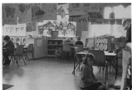
Grade 4 of Allambie school.

Description: This is a copy of an image published in the annual report for the Social Welfare Department for 1974-5.