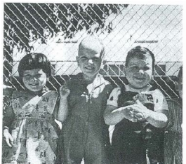
Healthy Members of St. Luke's Family at Bendigo