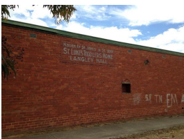
Sign on the rear wall at Langley Hall Bed & Breakfast, Bendigo (former site of St Luke's Toddlers' Home)

Description: This photograph was published in the Mission of St James and St John's journal, The Brothers .