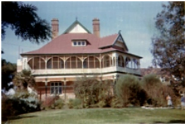
St Luke's Toddlers' Home