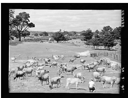
Ballarat, Orphanage Farm, Cows in Field