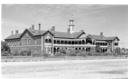
The Orphanage, Ballarat