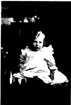
Who will adopt this Little Chap?

Description: This image appeared in the Methodist Spectator newspaper on 12 May 1899. 'Livingstone Home' was an early name for the Methodist Homes for Children in Cheltenham.