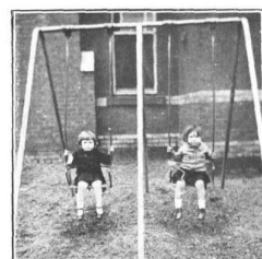
Fun on the Swings.

Description: This is an image of Methodist Homes for Children published in the pamphlet, Furnishings of love (1938). The caption reads: 'Children at Tea. State School in the Background.'