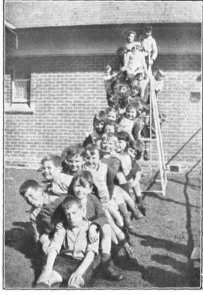
Smiles on the Slide.