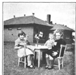
Children at Tea. State School in the Background.